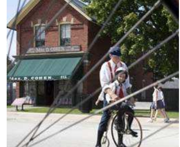
Greenfield Village's Main Street

Sears and other shops and some people will go to the movies.