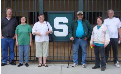
A group of GH colleagues pose in front of Spartan Stadium before the annual "Green and White" MSU football game.