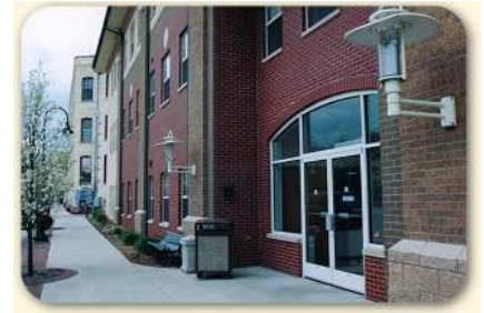
The front entrance to Traverse House.

Traverse House in Traverse City hosted the event, which we thought was well organized and friendly. They put on a good lunch of pulled pork sandwiches, buck-eye cookies, and chocolate chip cookies.