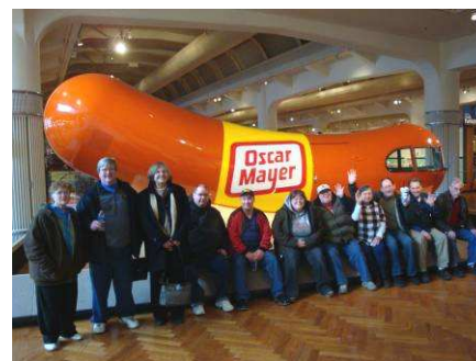
One of the many exhibits is the original Oscar Mayer wiener vehicle. We thought it would make an interesting background for our group photo!

There was so much to see that we didn't see it all; we all would like to go back, it was a great time.