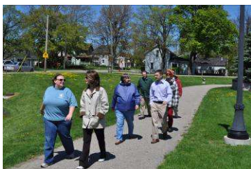
A group of colleagues walk together through the downtown park on our mile-long route.