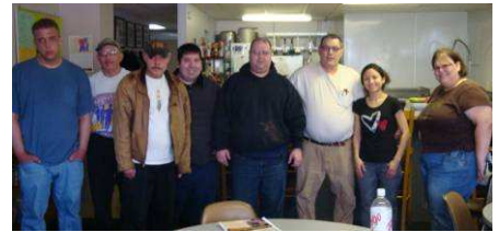
The GH gang pose for a picture prior to the Cooking Matters Class

looking for ways to improve our meals and their nutrition.