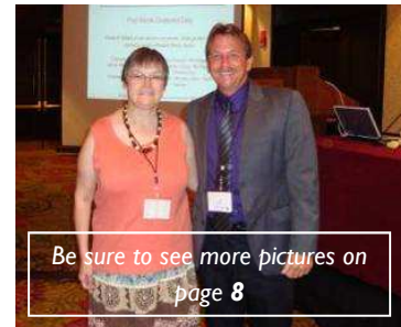
Be sure to see more pictures on page 8