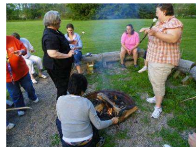
The group of leaders pose for a picture by the campfire.